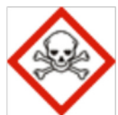
Skull and crossbones